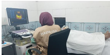
Performing Ultrasonography By HAEFA's Health Professionals